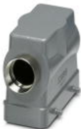
HEAVYCON sleeve housing B16, for double locking latch, height 76 mm, with support 1x M32, lateral conductor exit

Please be informed that the data shown in this PDF Document is generated from our Online Catalog. Please find the complete data in the user's documentation. Our General Terms of Use for Downloads are valid ( http://phoenixcontact.com/download )