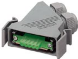
D-SUB complete connector, for DeviceNet, shell size 3, plug, screw connection, unshielded, connection direction straight, IP67 degree of protection

Please be informed that the data shown in this PDF Document is generated from our Online Catalog. Please find the complete data in the user's documentation. Our General Terms of Use for Downloads are valid ( http://phoenixcontact.com/download )