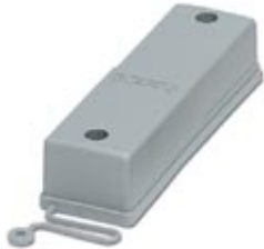
VARIOCON protective cover for sleeve housing, with IP50 protection, type 3, max. tightening torque: 1.6 Nm

Please be informed that the data shown in this PDF Document is generated from our Online Catalog. Please find the complete data in the user's documentation. Our General Terms of Use for Downloads are valid ( http://phoenixcontact.com/download )