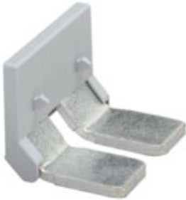
Insertion bridge, Number of positions: 2, Color: gray

Please be informed that the data shown in this PDF Document is generated from our Online Catalog. Please find the complete data in the user's documentation. Our General Terms of Use for Downloads are valid ( http://phoenixcontact.com/download )