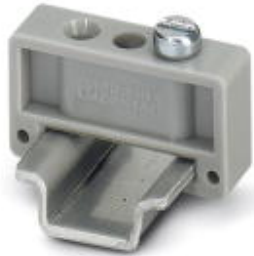
End clamp, width: 6.2 mm, color: gray

Please be informed that the data shown in this PDF Document is generated from our Online Catalog. Please find the complete data in the user's documentation. Our General Terms of Use for Downloads are valid ( http://phoenixcontact.com/download )