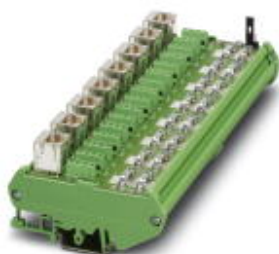
Patch panel, RJ45, DIN rail mounting, IP20, 8 slots, screw connection, CAT5e, option of shielding via jumpers

Please be informed that the data shown in this PDF Document is generated from our Online Catalog. Please find the complete data in the user's documentation. Our General Terms of Use for Downloads are valid ( http://phoenixcontact.com/download )