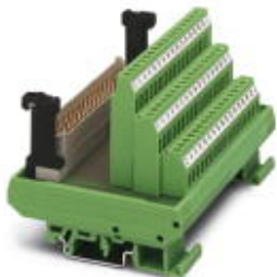
VARIOFACE module, for IEC 603/DIN 41612 connector, type F, 48-pos., z, b, d components mounted, with male connector, cable housing with screw interlock

Please be informed that the data shown in this PDF Document is generated from our Online Catalog. Please find the complete data in the user's documentation. Our General Terms of Use for Downloads are valid ( http://phoenixcontact.com/download )