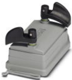
HEAVYCON ADVANCE IP65 protective cover B6, with bayonet locking, with retaining cord, diameter of retaining cord eyelet 3 mm

Please be informed that the data shown in this PDF Document is generated from our Online Catalog. Please find the complete data in the user's documentation. Our General Terms of Use for Downloads are valid ( http://phoenixcontact.com/download )