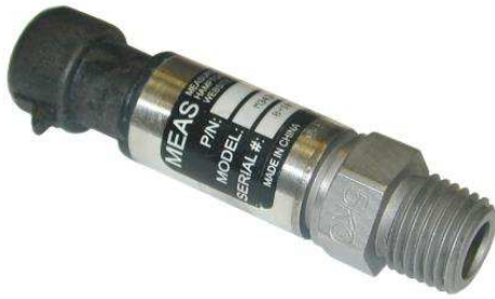
Shown with Packard Connector