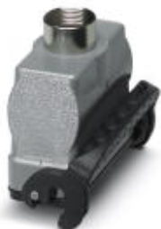
HEAVYCON B16 coupling housing, with single locking latch, height: 82 mm, with 1 x M32 gland, straight cable outlet

Please be informed that the data shown in this PDF Document is generated from our Online Catalog. Please find the complete data in the user's documentation. Our General Terms of Use for Downloads are valid ( http://phoenixcontact.com/download )