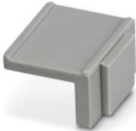
Device marking label, width: 12 mm, area: 12 x 8 mm, e.g. for EML(10x7) R adhesive marking material

Please be informed that the data shown in this PDF Document is generated from our Online Catalog. Please find the complete data in the user's documentation. Our General Terms of Use for Downloads are valid ( http://phoenixcontact.com/download )