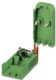
Cable housing, Pitch: 0 mm, Number of positions: 4, Dimension a: 32.28 mm, Color: green

Please be informed that the data shown in this PDF Document is generated from our Online Catalog. Please find the complete data in the user's documentation. Our General Terms of Use for Downloads are valid ( http://phoenixcontact.com/download )