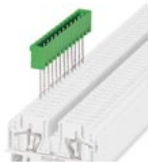
The illustration shows a 12-position version

Please be informed that the data shown in this PDF Document is generated from our Online Catalog. Please find the complete data in the user's documentation. Our General Terms of Use for Downloads are valid ( http://phoenixcontact.com/download )