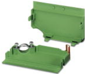
Cable housing, Pitch: 0 mm, Number of positions: 11, Dimension a: 55 mm, Color: green

Please be informed that the data shown in this PDF Document is generated from our Online Catalog. Please find the complete data in the user's documentation. Our General Terms of Use for Downloads are valid ( http://phoenixcontact.com/download )