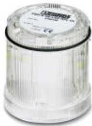
LED random flashing beacon element, 24 V DC, clear

Please be informed that the data shown in this PDF Document is generated from our Online Catalog. Please find the complete data in the user's documentation. Our General Terms of Use for Downloads are valid ( http://phoenixcontact.com/download )