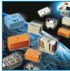
Schrack PCB Relays