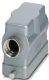
HEAVYCON B16 sleeve housing, for single locking latch, height: 76 mm, with 1 x M32 gland, lateral cable outlet

Please be informed that the data shown in this PDF Document is generated from our Online Catalog. Please find the complete data in the user's documentation. Our General Terms of Use for Downloads are valid ( http://phoenixcontact.com/download )