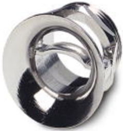
Pressure screws, with flared cable guard, clamping area 9.5-15 mm, for housing with Pg16 support

Please be informed that the data shown in this PDF Document is generated from our Online Catalog. Please find the complete data in the user's documentation. Our General Terms of Use for Downloads are valid ( http://phoenixcontact.com/download )