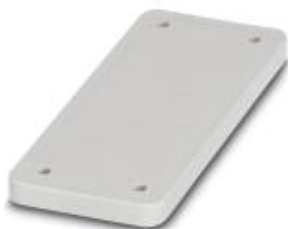
HEAVYCON cover plate, for wall cutouts of type B16, 7 mm thick, gray

Please be informed that the data shown in this PDF Document is generated from our Online Catalog. Please find the complete data in the user's documentation. Our General Terms of Use for Downloads are valid ( http://phoenixcontact.com/download )