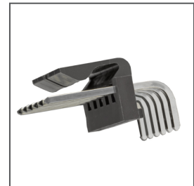
KK® 396 RPC Vertical and Right-Angle Headers with Friction Lock