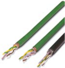
Remote bus cable for fixed installation, sold by the meter

Please be informed that the data shown in this PDF Document is generated from our Online Catalog. Please find the complete data in the user's documentation. Our General Terms of Use for Downloads are valid ( http://phoenixcontact.com/download )