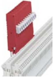
Test plugs, Color: red

Please be informed that the data shown in this PDF Document is generated from our Online Catalog. Please find the complete data in the user's documentation. Our General Terms of Use for Downloads are valid ( http://phoenixcontact.com/download )