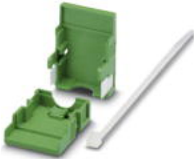
Cable housing, Pitch: 3.81 mm, Number of positions: 2, Dimension a: 10.01 mm, Color: green

Please be informed that the data shown in this PDF Document is generated from our Online Catalog. Please find the complete data in the user's documentation. Our General Terms of Use for Downloads are valid ( http://phoenixcontact.com/download )