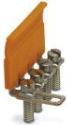
Switching jumper, Number of positions: 4, Color: silver

Please be informed that the data shown in this PDF Document is generated from our Online Catalog. Please find the complete data in the user's documentation. Our General Terms of Use for Downloads are valid ( http://phoenixcontact.com/download )