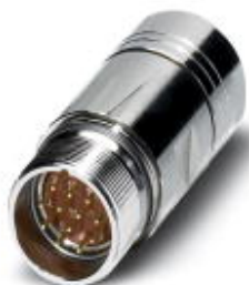
Coupler connector, straight, Screw locking, M23, number of positions: 17, type of contact: Pin, Crimp connection, shielded: yes, cable diameter range: 9 mm ... 13.2 mm

Please be informed that the data shown in this PDF Document is generated from our Online Catalog. Please find the complete data in the user's documentation. Our General Terms of Use for Downloads are valid ( http://phoenixcontact.com/download )