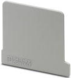
End cover, Length: 42.5 mm, Width: 1.3 mm, Color: gray

Please be informed that the data shown in this PDF Document is generated from our Online Catalog. Please find the complete data in the user's documentation. Our General Terms of Use for Downloads are valid ( http://phoenixcontact.com/download )