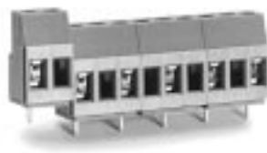
AK800 Front Wire Entry

Pin Spacing 10mm (.394) Stripping Length 8mm (.315) Screw Hole Diameter 3.5mm (.138)