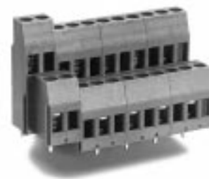
AK850 Front Wire Entry

Pin Spacing 10mm (.394) Stripping Length 8mm (.315) Screw Hole Diameter 3.5mm (.138)