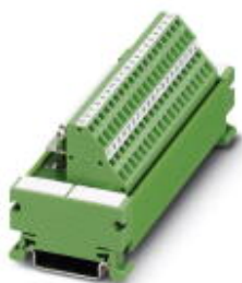
VARIOFACE module, with spring-cage connection and D-Subminiature socket strip, for mounting on NS 35/7.5, 37-pos.

Please be informed that the data shown in this PDF Document is generated from our Online Catalog. Please find the complete data in the user's documentation. Our General Terms of Use for Downloads are valid ( http://phoenixcontact.com/download )