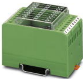
Diode module, with eight diodes, common cathode, diode type 1N 5408

Please be informed that the data shown in this PDF Document is generated from our Online Catalog. Please find the complete data in the user's documentation. Our General Terms of Use for Downloads are valid ( http://phoenixcontact.com/download )