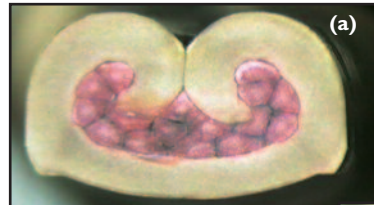
Cross Sections Showing Minimum (a) and Maximum (b) Area Index per Terminal Specification—a Variation of \pm 3.5\%

Therefore, varying the CW by 2% would result in a CH variation of 2%, or 0.0014 in. At a CH tolerance of \pm 0.002 in, 35% of the total CH tolerance would be used by a 2% variation in CW. Thus, the importance of crimp width control is obvious when tooling is changed during a production run.