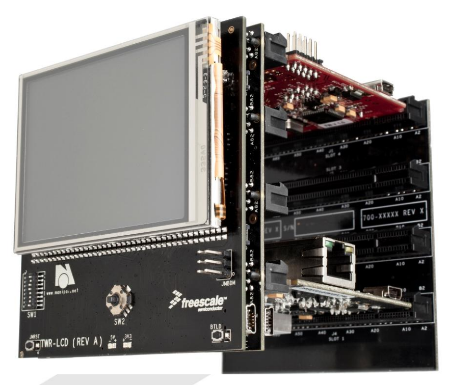
Figure 2 - Tower System with TWR-LCD