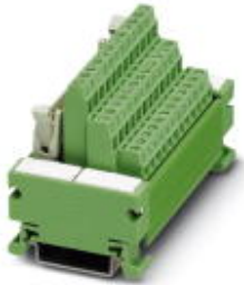
VARIOFACE module, with screw connection and flat-ribbon cable connector, for assembly on NS 35/7.5, 34 positions

Please be informed that the data shown in this PDF Document is generated from our Online Catalog. Please find the complete data in the user's documentation. Our General Terms of Use for Downloads are valid ( http://phoenixcontact.com/download )