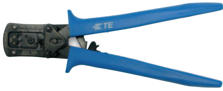
Crimping Tool, PN 6-1579014-8