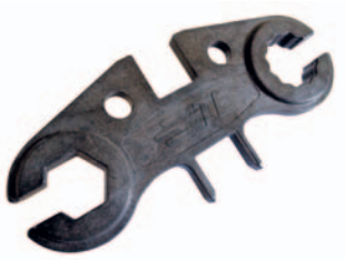
Field Tool - multiple functions, PN 1971903-1