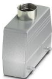
HEAVYCON sleeve housing B24, for double locking latch, height 76 mm, with support 1x M25, straight conductor exit

Please be informed that the data shown in this PDF Document is generated from our Online Catalog. Please find the complete data in the user's documentation. Our General Terms of Use for Downloads are valid ( http://phoenixcontact.com/download )