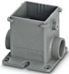
DUPLICON, aluminum T-box, type B6, IP67 protection, 2 x M20 cable screw connection thread (without cable screw connection)

Please be informed that the data shown in this PDF Document is generated from our Online Catalog. Please find the complete data in the user's documentation. Our General Terms of Use for Downloads are valid ( http://phoenixcontact.com/download )