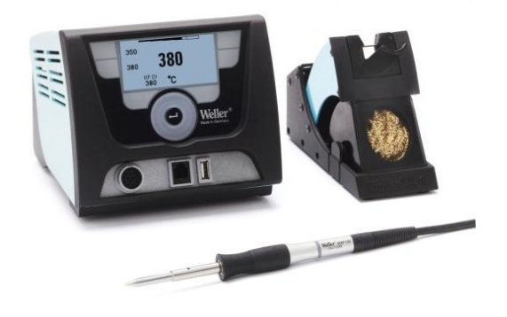
WX 1 control unit with WXP 120 (120 W / 24 V) soldering pencil and WDH 10 safety rest