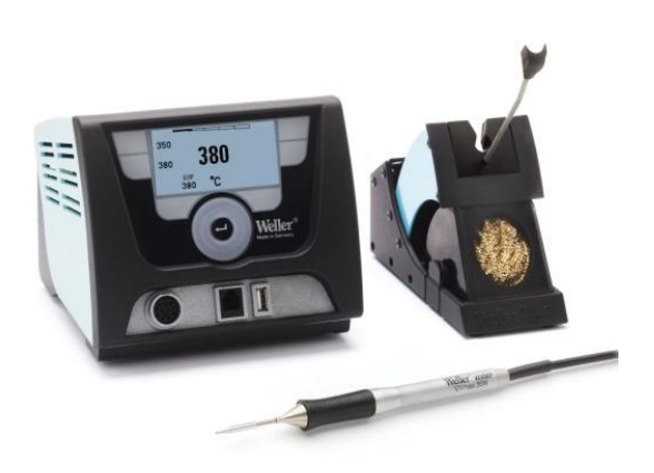
WX 1 control unit with WXMP Micro soldering pencil (40W / 12V) and WDH 50 safety rest