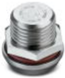
Plug, M20, for FB... enclosure