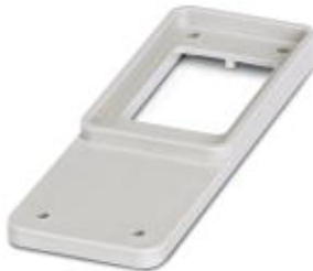
HEAVYCON adapter plate, type B24 on B6, for panel cutouts of type B24, gray

Please be informed that the data shown in this PDF Document is generated from our Online Catalog. Please find the complete data in the user's documentation. Our General Terms of Use for Downloads are valid ( http://phoenixcontact.com/download )