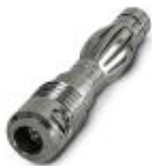
Test plugs, Color: silver