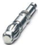
Test plugs, Color: silver