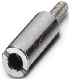
Locking screw barrel, for a firm connection of contact inserts and DIN-rail mountable terminal adapters

Please be informed that the data shown in this PDF Document is generated from our Online Catalog. Please find the complete data in the user's documentation. Our General Terms of Use for Downloads are valid ( http://phoenixcontact.com/download )