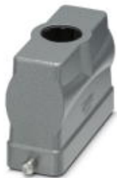
HEAVYCON B24 sleeve housing, for single locking latch, height: 76 mm, with 1 x M25 thread, straight cable outlet

Please be informed that the data shown in this PDF Document is generated from our Online Catalog. Please find the complete data in the user's documentation. Our General Terms of Use for Downloads are valid ( http://phoenixcontact.com/download )