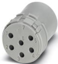
Contact insert, number of positions: 6, type of contact: Socket, Crimp connection

Please be informed that the data shown in this PDF Document is generated from our Online Catalog. Please find the complete data in the user's documentation. Our General Terms of Use for Downloads are valid ( http://phoenixcontact.com/download )