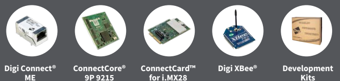
Digi Connect® ME