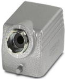
Sleeve housing, for single locking latch, height 52 mm, with screw connection, 1x Pg16, lateral cable entry

Please be informed that the data shown in this PDF Document is generated from our Online Catalog. Please find the complete data in the user's documentation. Our General Terms of Use for Downloads are valid ( http://phoenixcontact.com/download )