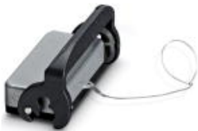
HEAVYCON protective cover, type B16, for sleeve housing without single locking latch, with retaining cord, IP65, ALU

Please be informed that the data shown in this PDF Document is generated from our Online Catalog. Please find the complete data in the user's documentation. Our General Terms of Use for Downloads are valid ( http://phoenixcontact.com/download )