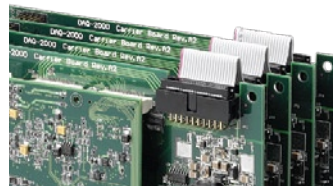
SSi bus cable for multiple card synchronization for DAQ/DAQe-2000 series