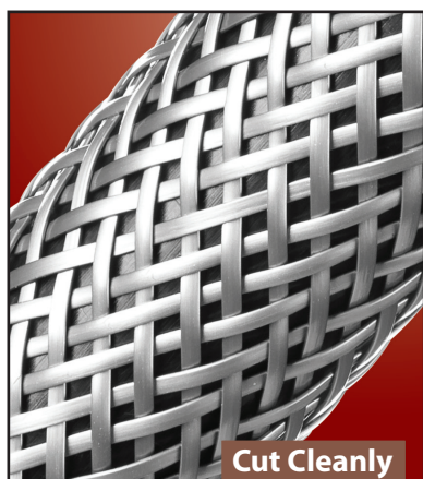
Cut Cleanly Hot Knife