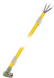
Sensor/actuator cable, 3-position, PVC, yellow, free cable end, on Socket angled M8, with 2 LEDs, cable length: 5 m

Please be informed that the data shown in this PDF Document is generated from our Online Catalog. Please find the complete data in the user's documentation. Our General Terms of Use for Downloads are valid ( http://phoenixcontact.com/download )