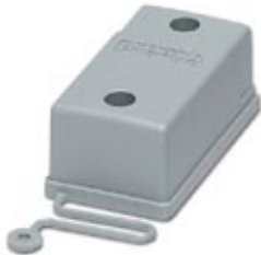
VARIOCON protective cover for sleeve housing, with IP50 protection, type 1, max. tightening torque: 1.6 Nm

Please be informed that the data shown in this PDF Document is generated from our Online Catalog. Please find the complete data in the user's documentation. Our General Terms of Use for Downloads are valid ( http://phoenixcontact.com/download )