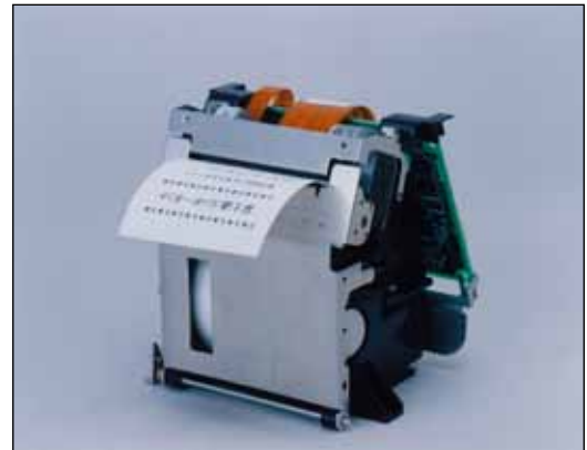
FTP-627USL401 platen/cutter closed